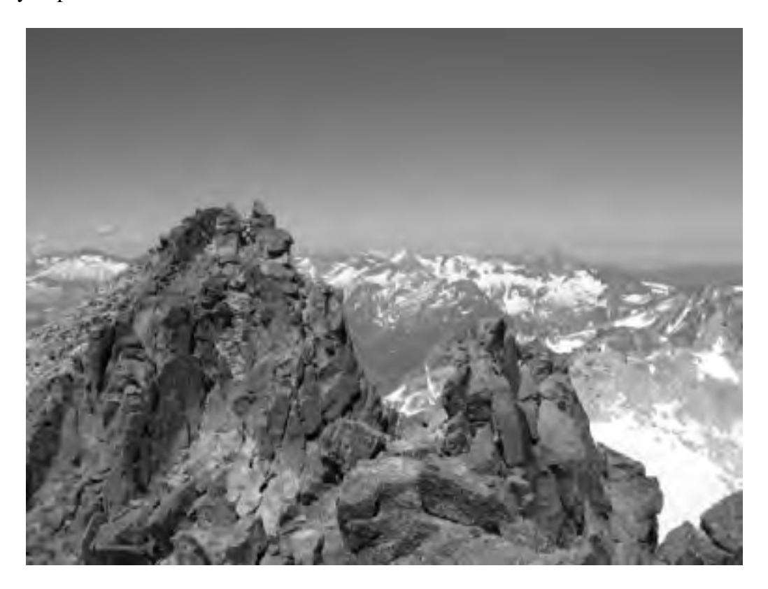
The Cresterio del Medio

During the following week and a half many peaks were climbed including Pico de Posets, 3375m, the second highest peak in the Pyrenees and Perdiguero, with stunning views. There had been a lot of late spring snow which still lingered on many slopes above 2,500m which probably made the ascents easier as the snow undoubtedly covered loose scree slopes which are exposed later in the summer. The quality of the rock on the 'cresterios' linking peaks is often excellent giving fine exposed scrambling and solo climbing reminiscent of Skye, but longer, higher and very airy in places!