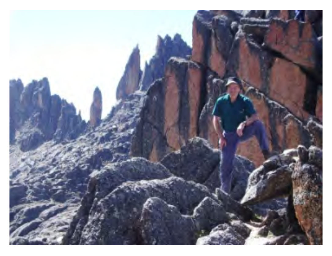
Quimsa Cruz – Paso Torrini Araca