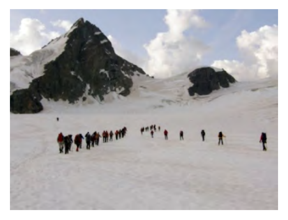
Haute Route Trek –the crowds leave the Vignettes hut By Ed Bramley