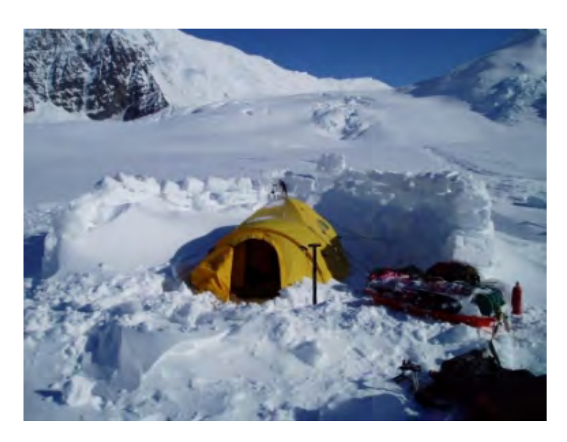
Denali – first camp after storm