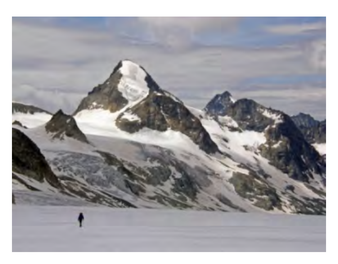
Haute Route Trek –on the Otemma glacier