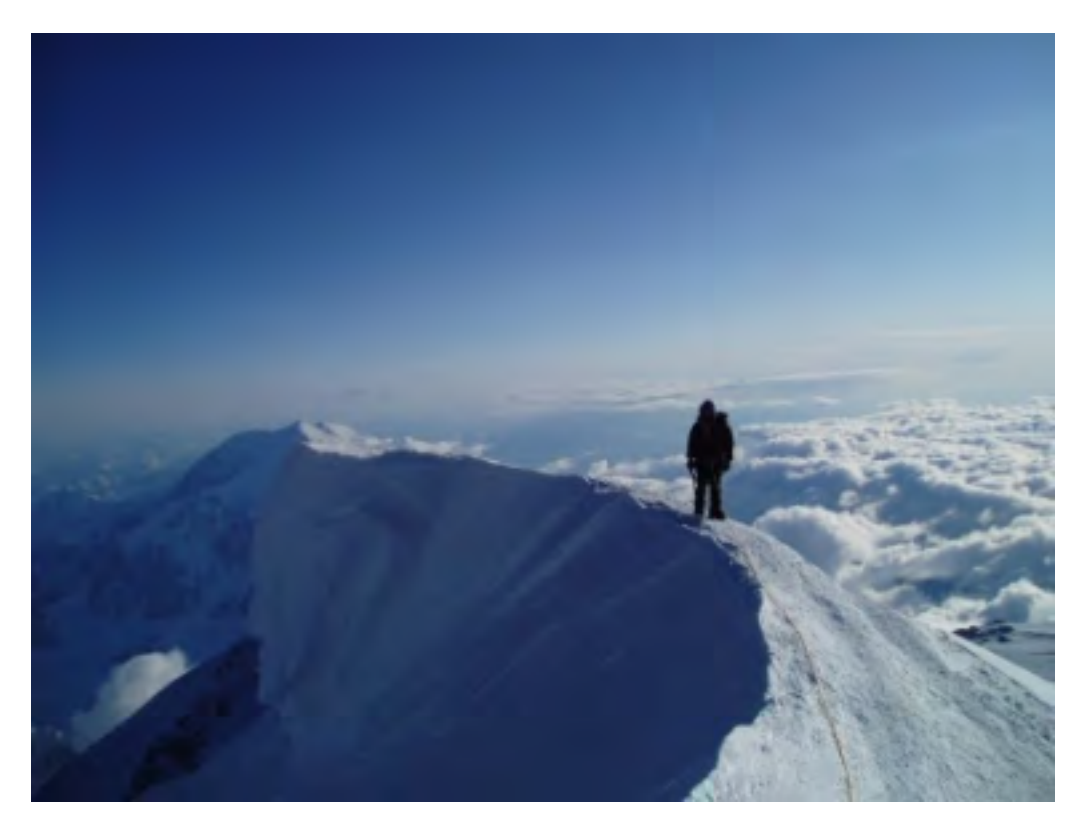
Denali – the summit ridge