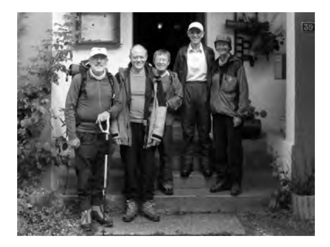
The team at the start

for the day up to Col de la Forclaz. The dry bed and warm food are very welcome.