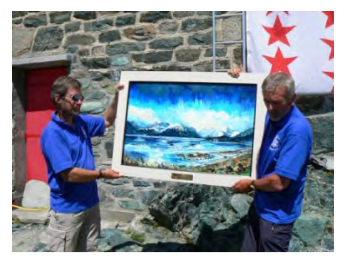
Centenary Celebrations – Britannia Hut