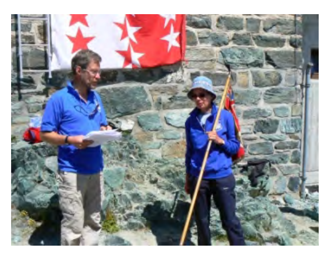
Centenary Celebrations – Britannia Hut