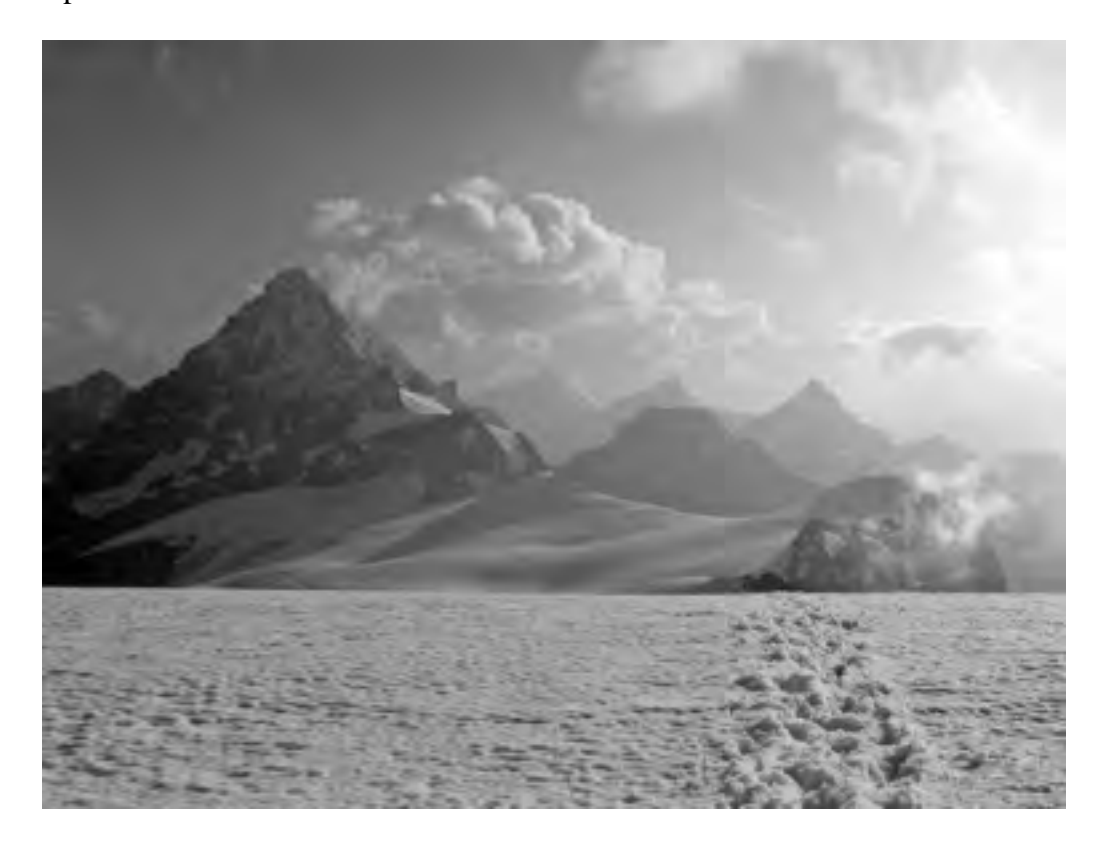
Dente Blanche from the Tete Blanche, by Ed Bramley

Next morning, to beat the inevitable queue on the ladders, we are amongst the first down them that day, at 4:30am. As we start out over the ice, a look back shows a veritable Christmas tree of lights from other parties as they descend the series of ladders. There is a slow rising ascent of the Mont Miné glacier, made even slower by the wind blowing through Col des Bouquetins. It's veritably Cairngorm like in nature, buffeting people and occasionally stopping us in our tracks. As we swing into the lee of the Tête Blanche, the wind thankfully drops off, but there is still low cloud covering the summit, which we skirt the top of.